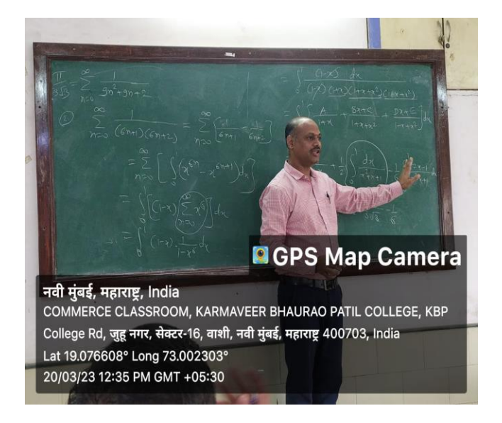
Students and Faculty members attending the talk